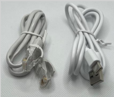
Network Cable USB-Type C cable