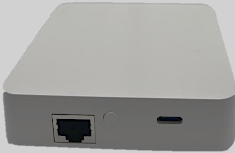
LAN port to Home WIFI Router USB power port